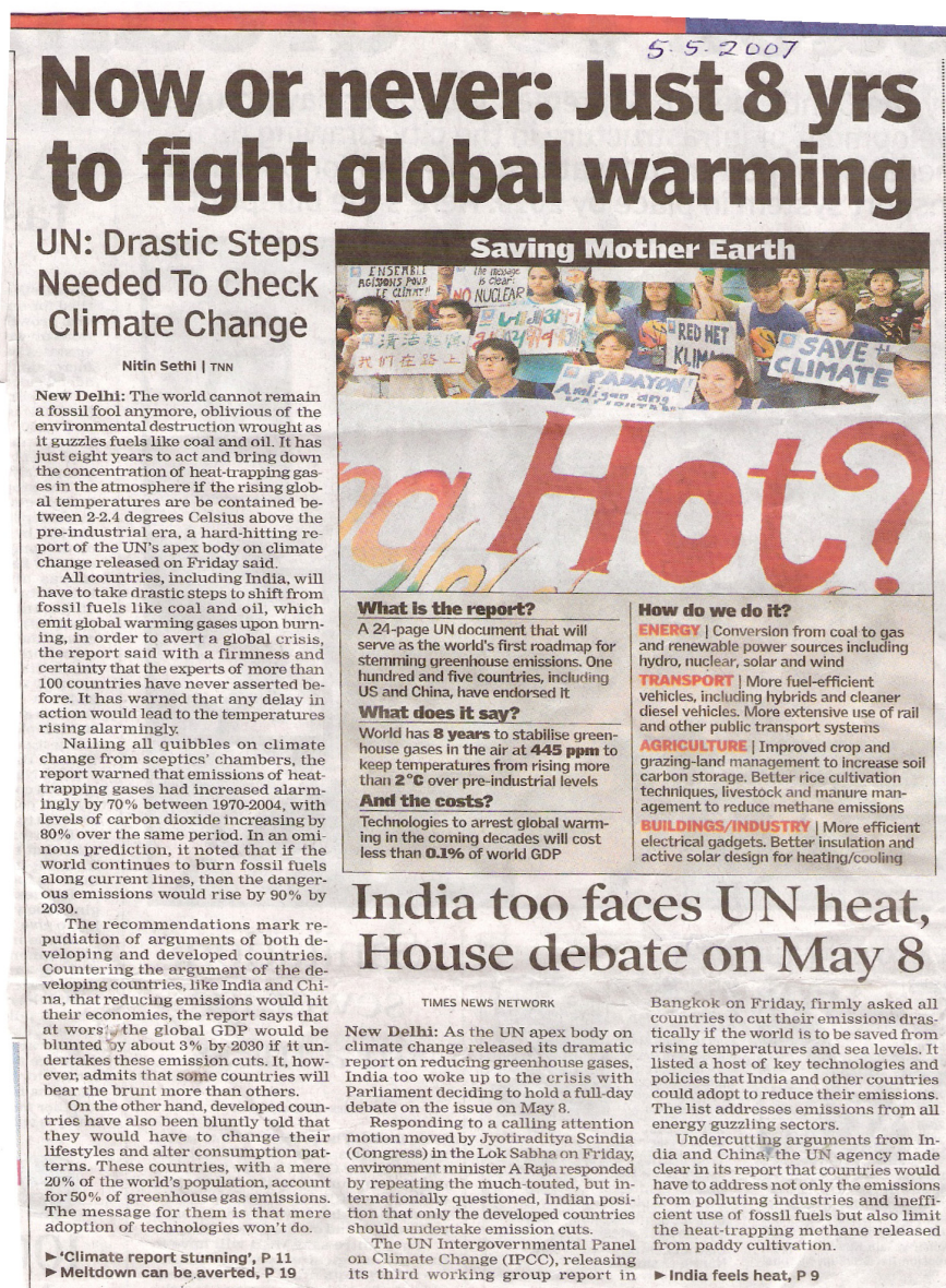
Fig. 2 A clipping from a newspaper dated 5 May 2007.

For the past couple of years, both television news channels as well as newspapers in India have been focusing on the significance of environmental change occurring in India. Almost everyday we see one or